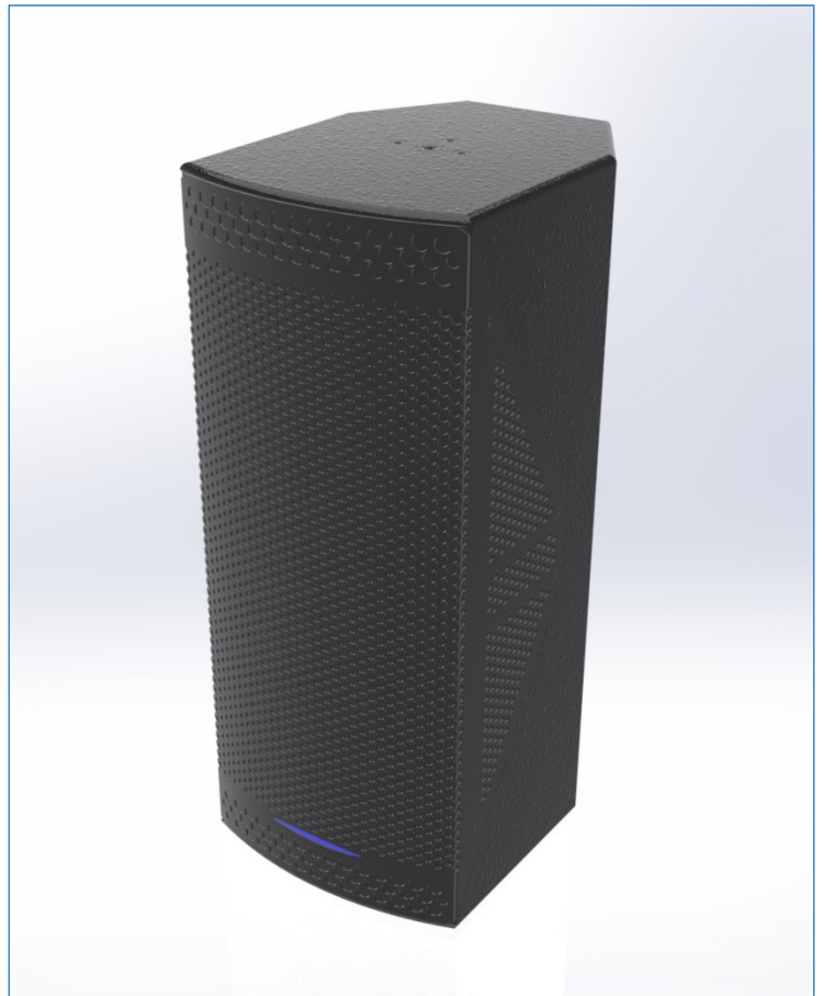
SPOT 2.6-i speaker

SPOT 2.6-i is only available in 16 Ohm. An optional external 200W transformer allows SPOT to be connected to 100V line set up.